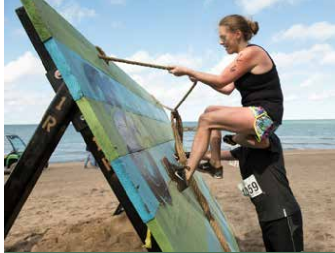
"ANGLE WRANGLE" WAS A BEAST FAVORITE