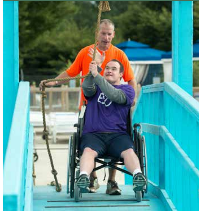
10-MILE AND ADAPTED COURSE PARTICIPANTS COME TOGETHER TO TACKLE THE FINAL OBSTACLE.